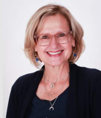
MAYOR LINDA BLECHINGER

One month ago the City of Auburn held its municipal elections. During this election season there were two City Council seats and the Mayor's seat up for voting.